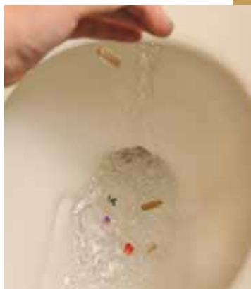
Pharmaceutical drugs flushed down the toilet (left) and soap going down the sink (right) end up in wastewater but are not completely eliminated from it. Some of it shows up in tap water.